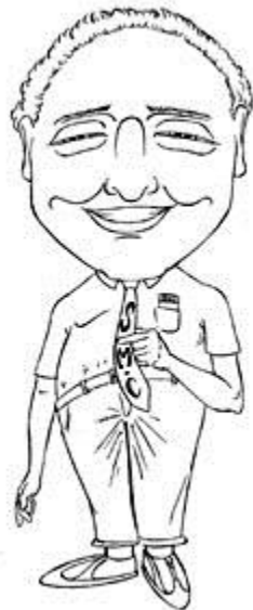
Francis H. C. Crick