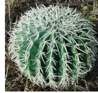
Barrel Cactus found in North American deserts