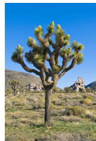
Joshua Tree found only in the Mojave Desert