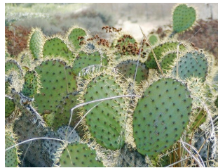
Prickly Pear Cactus found in the Sonoran and the Mojave Deserts