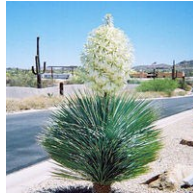
Soaptree Yucca found in North American deserts