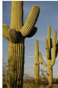
Saguaro Cactus found in North American deserts