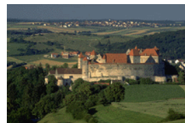
Caption describing picture or graphic.

Lorem ipsum dolor sit amet, consectetur adipiscing elit, sed diam nonummy nibh euismod tincidunt ut laoreet