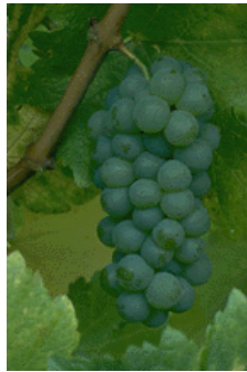
Caption describing picture or graphic.

The most important information is included here on the inside panels. Use these panels to introduce your organization and describe specific products or services.